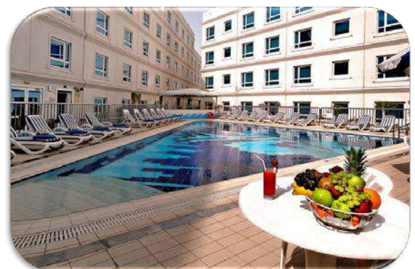
Accessible Swimming Pool