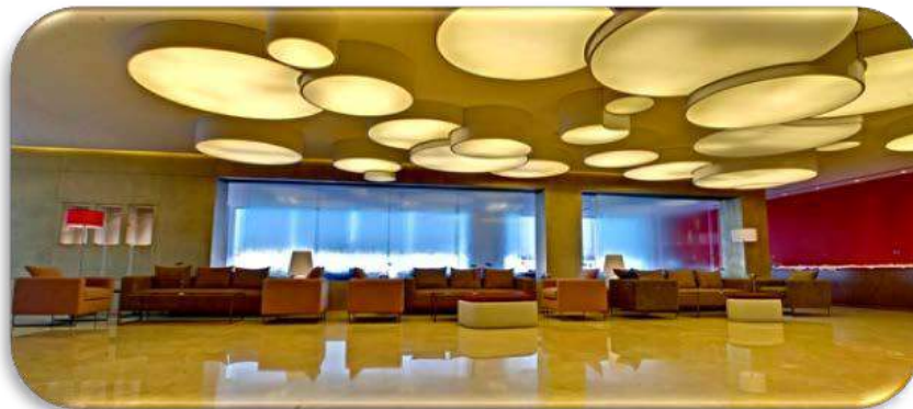
Free Internet in the Lobby